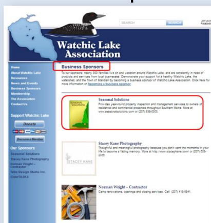
Figure 2. List of all business sponsors with short overview (~45 words)