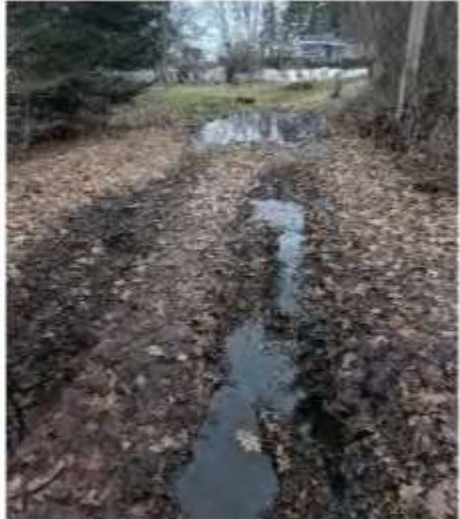
Sediment transport towards lake in spring 2020 (left) and ponding and rutting on the Watchic Road 3/Hartford Lane in spring 2019 (right).