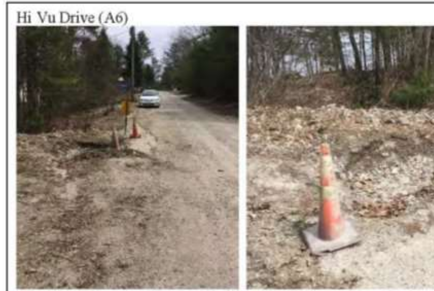
Sloped road approaching site (left), eroded hole at clogged culvert outlet (right).