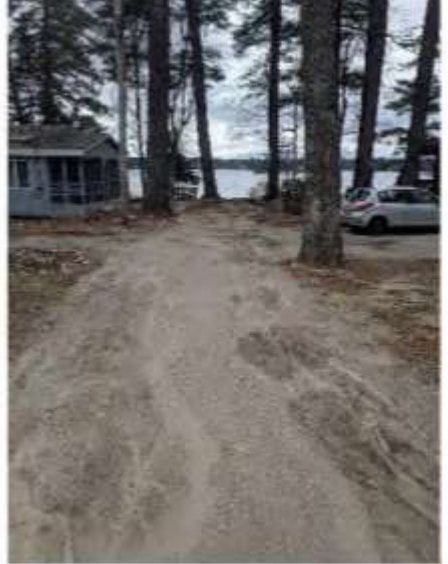
The timber frame lip overlooking the right of way to the lake in spring 2020 (left) and stormwater runoff and sediment transport evident in Spring 2019 (right).