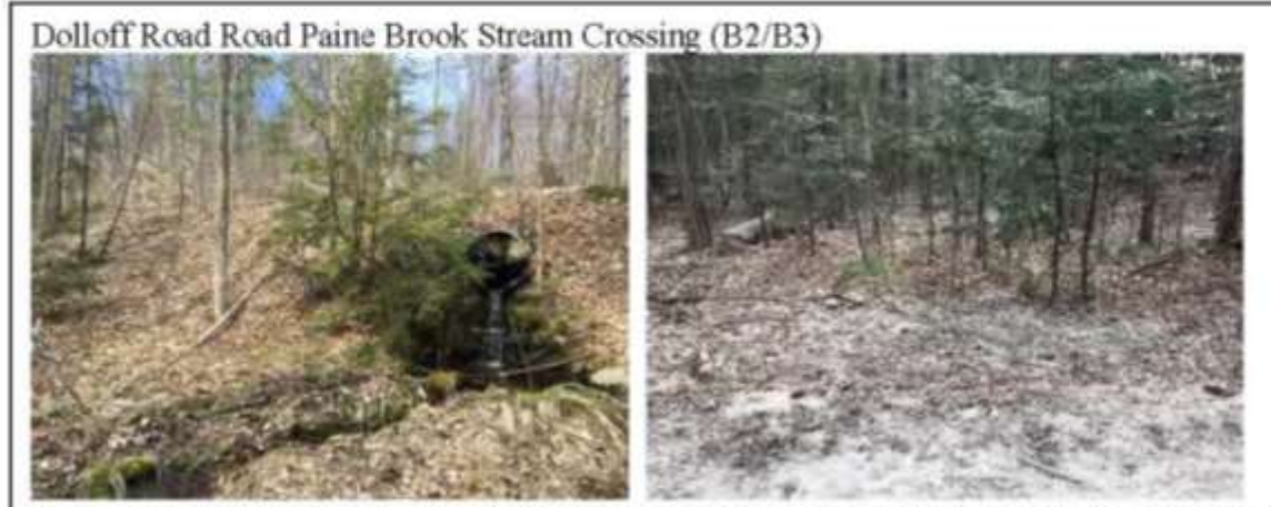
Culvert outlet from downstream (left), sediment washing down bank to right of culvert (right).