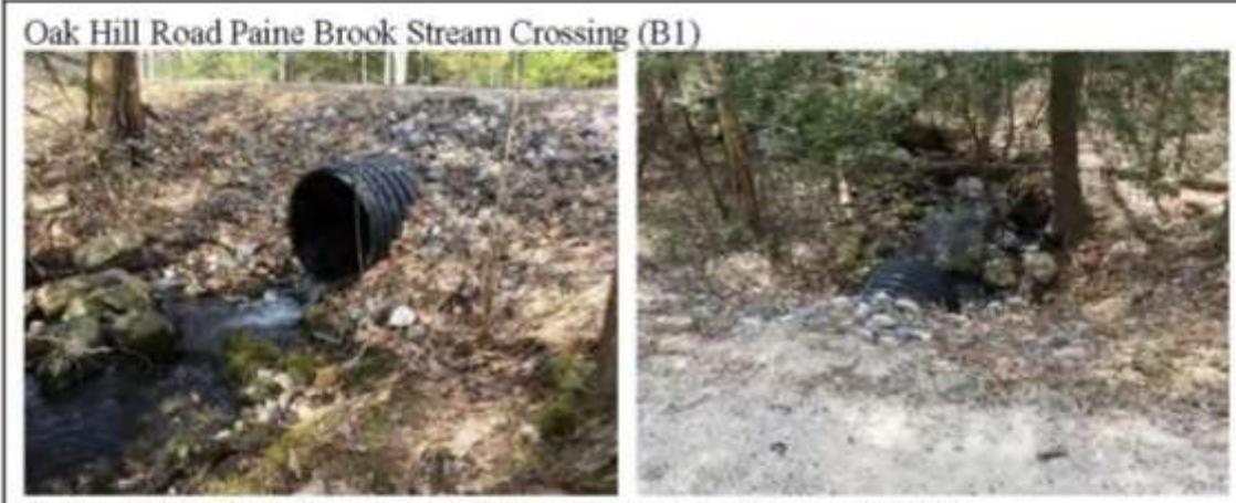
Culvert outlet from downstream (left), culvert outlet from road (right).