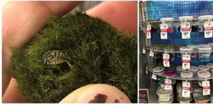
Left: a moss ball, Right: display of moss balls for sale at a pet store