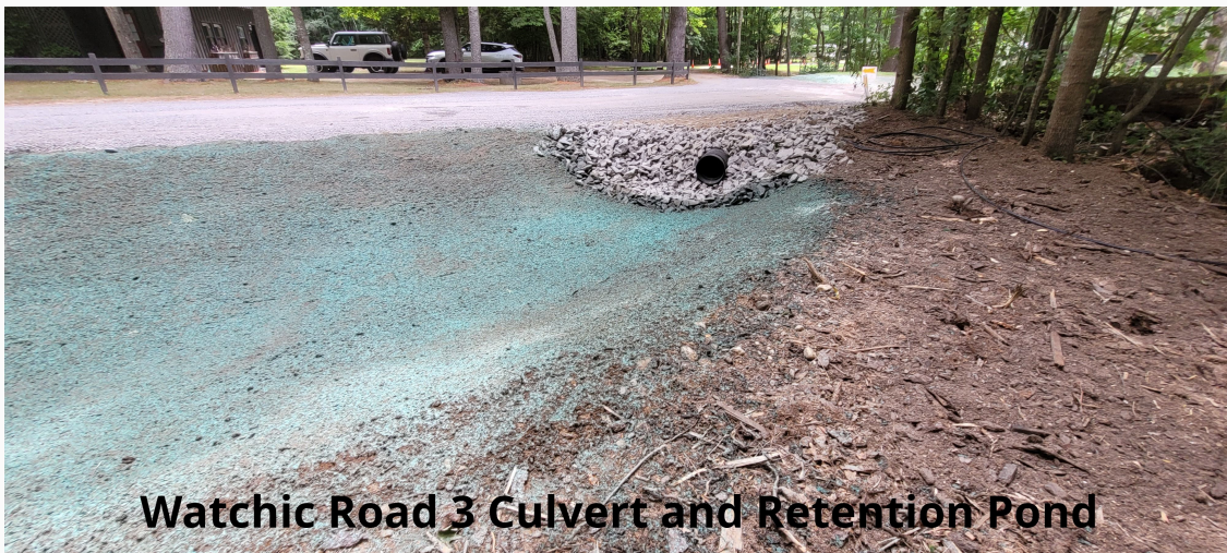
Watchic Road 3 Culvert and Retention Pond

We want to thank Maine DEP and the EPA and note that funding for the projects, in part, will be provided by the U.S. EPA under Section 319 of the Clean Water Act. The funding is administered by the Maine DEP in partnership with EPA. The EPA does not endorse any commercial products or services mentioned in the work plan.